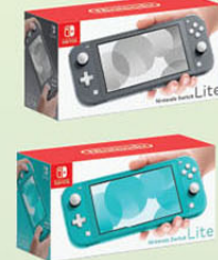
Nintendo Nintendo Switch Lite Gaming System