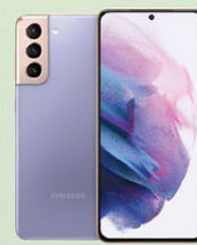
SAMSUNG Galaxy Z1