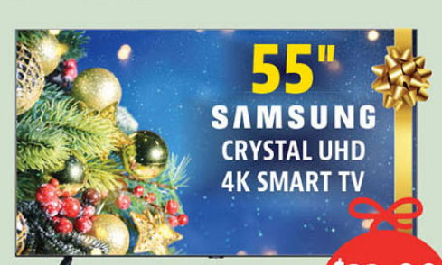
SAMSUNG 55" Crystal UHD 4K Smart TV #TU8000