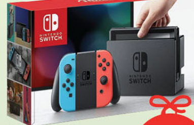
Nintendo Nintendo Switch Gaming System