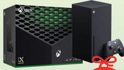
XBOX Xbox X Gaming System