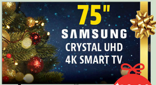
SAMSUNG 75" Crystal UHD 4K Smart TV #TU7000

CELL PHONES AVAILABLE FOR CURRENT CUSTOMERS ONLY. SEE MANAGER FOR DETAILS.