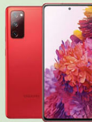
SAMSUNG Galaxy S20 FE 5G