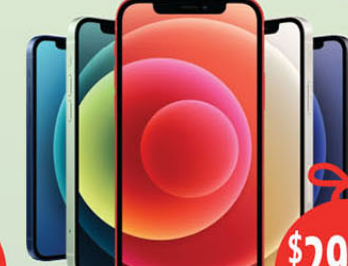
APPLE iPhone 12