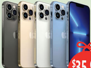
APPLE iPhone 13 Pro