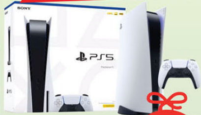
PS5 Sony PS5 Gaming System

UNDER FORMER BLUE RIBBON MANAGEMENT IN ST. CLAIRSVILLE