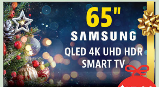
SAMSUNG 65" QLED 4K UHD HDR Smart TV #TU8000